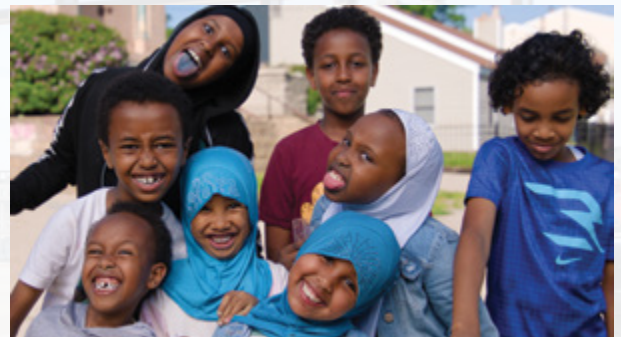
Above: Children who live in CommonBond's Torre de San Miguel community in Saint Paul, MN.

That's why we start with an affordable home. Then, with the support of