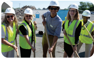
Rise on 7 groundbreaking event

We built Rise on 7, Minnesota's first-ever co-located affordable housing and early childhood education center, in partnership with Rise Early Learning and Way to Grow.