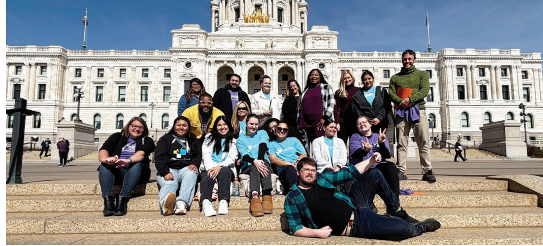
CommonBond staff in front of the capitol building in Saint Paul, MN

CommonBond's pioneering use of your contributions through the MN state contribution credit has already set 605 homes up for the future, improving quality and reducing energy use.